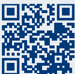
Plasterboard Installation Manual